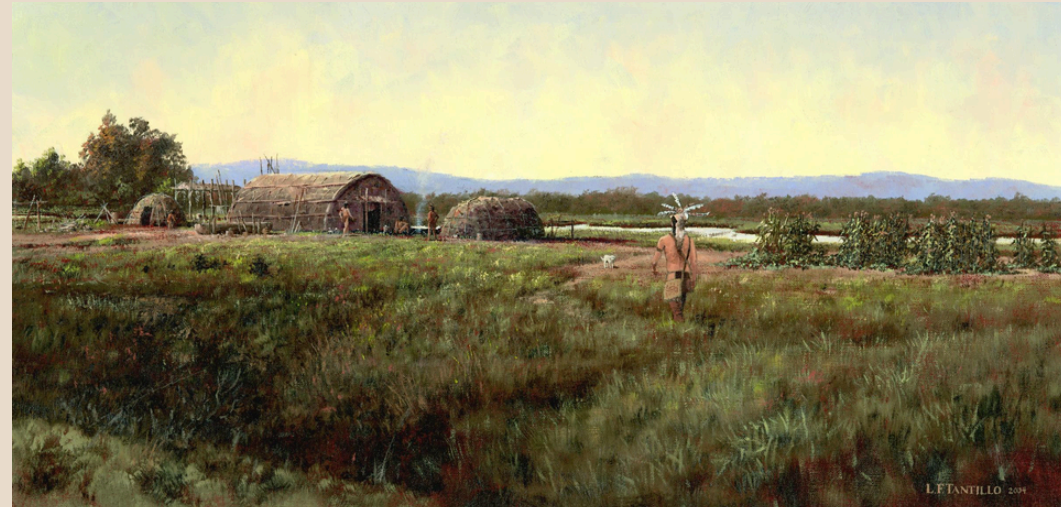
Painting entitled "Pap-scan-ee" by Len Tantillo.

The Stockbridge-Munsee has achieved a significant milestone by reclaiming ownership of the Nature Preserve portion of the original Island in 2021. This endeavor has been instrumental in defending the Island's natural beauty and ecological integrity from developers. Our Tribe is committed to keeping the Preserve open to the public. By sharing the rich history and cultural significance of Papscaanee Island with visitors, the Tribe ensures that its heritage remains alive and cherished. This commitment to remembrance and preservation underscores Stockbridge-Munsee's dedication to safeguarding its ancestral lands and fostering a deeper appreciation.