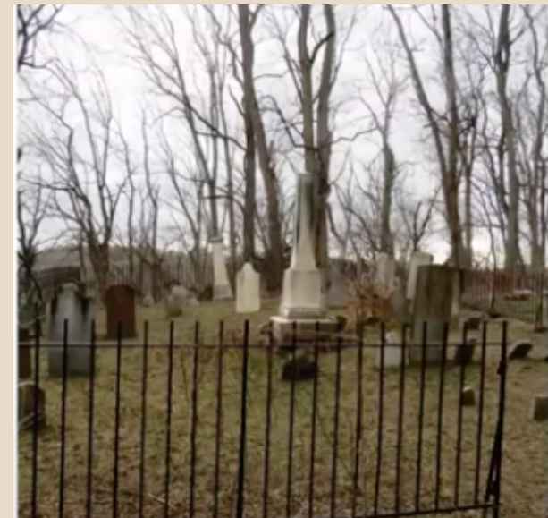
Historic cemetery, with the earliest marked grave at 1707.