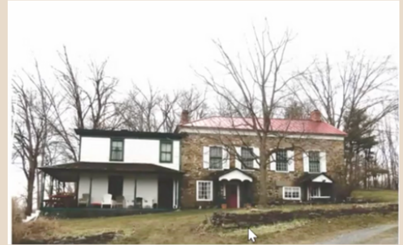
Standing early Dutch stone house on the island.