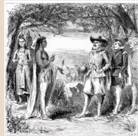
Hudson and Native Americans, Wood Engraving, American, 1876

Property is associated with historic event or activities